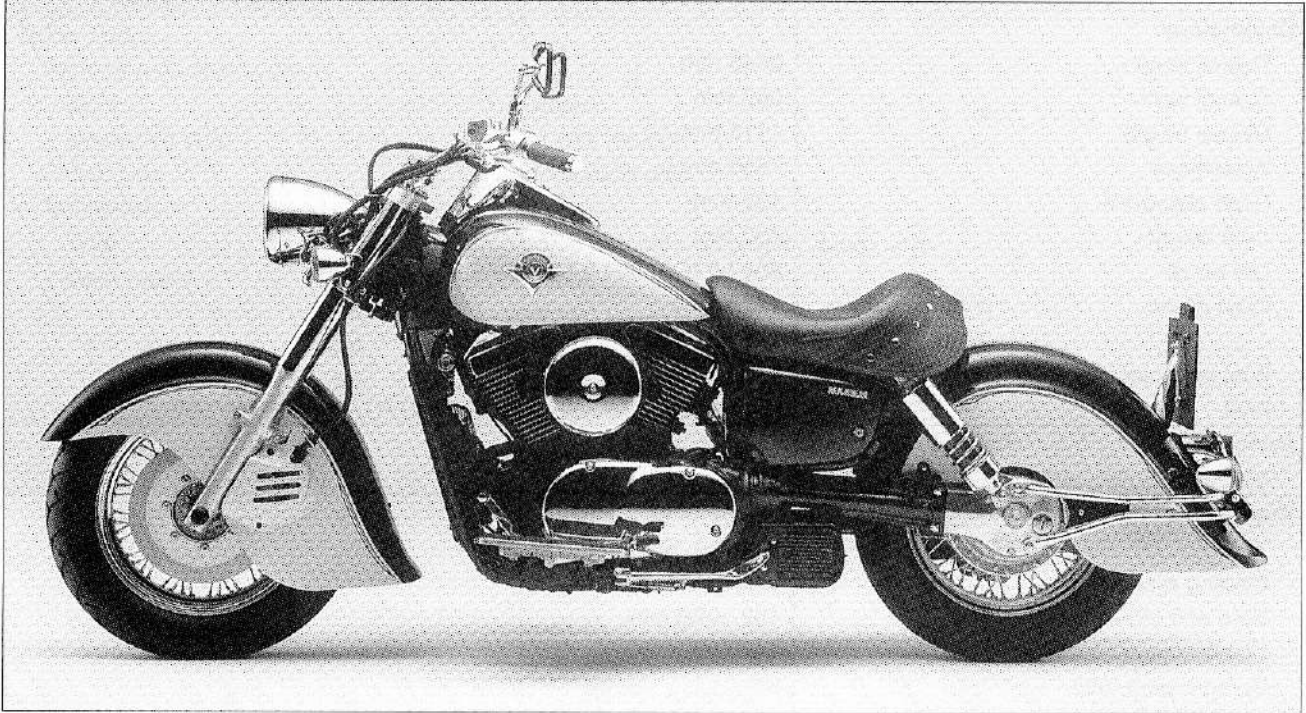
VN1500-R1 (Other than US, Canada) Right Side View: